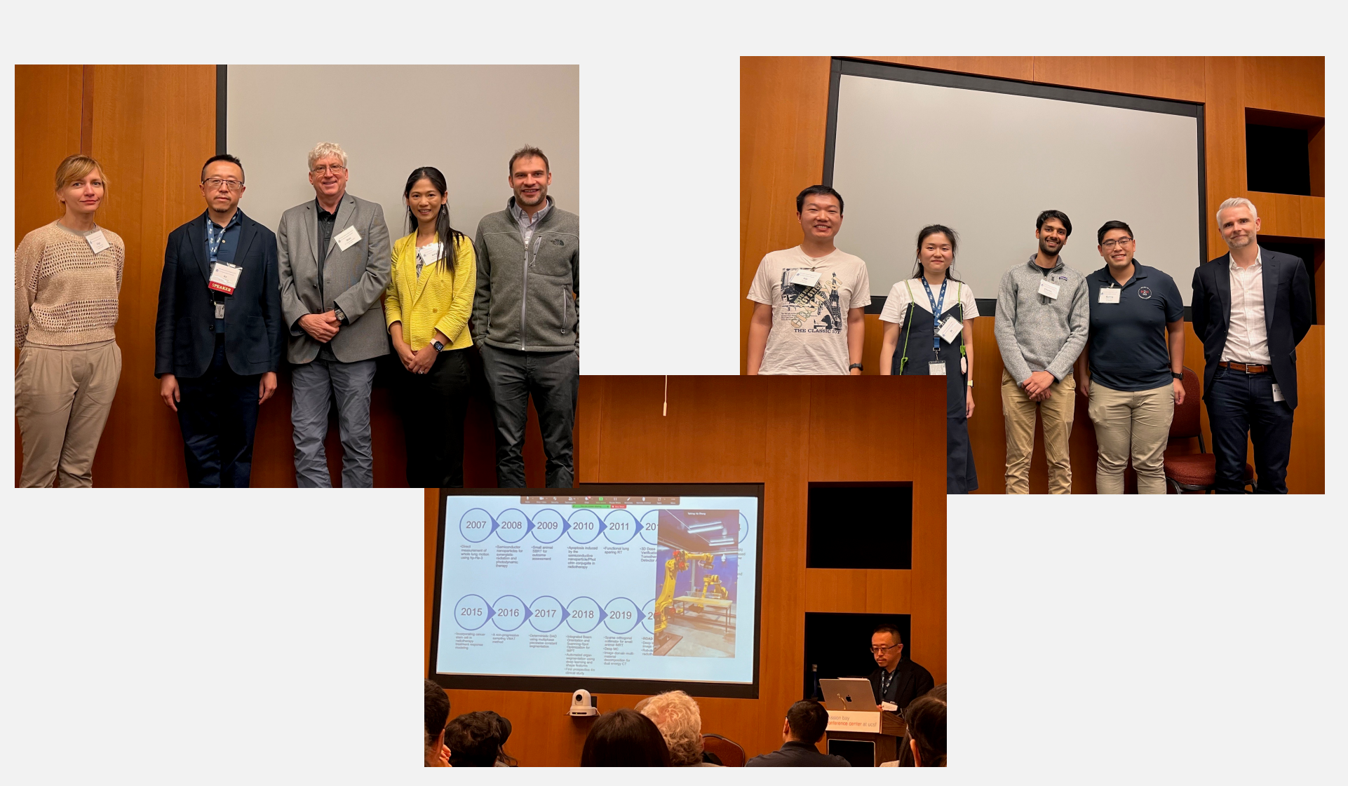
2023 Annual Fall Meeting, Walnut Creek