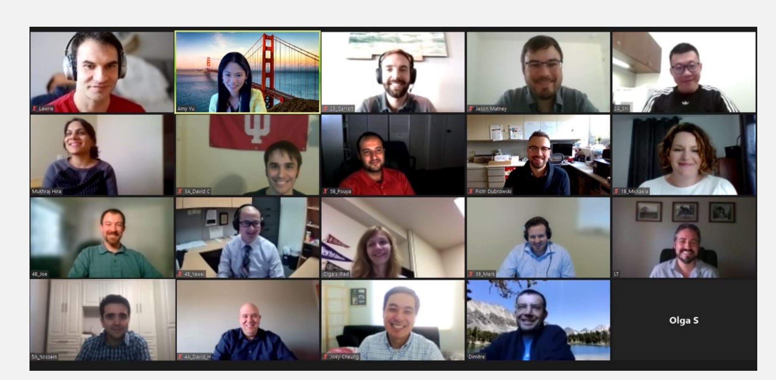
2019 Young Investigator's Symposium, UC Berkeley