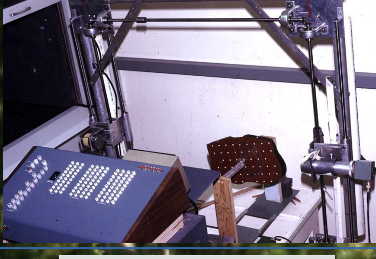
First MeV CT-simulator