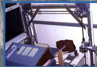
First MeV CT-simulator