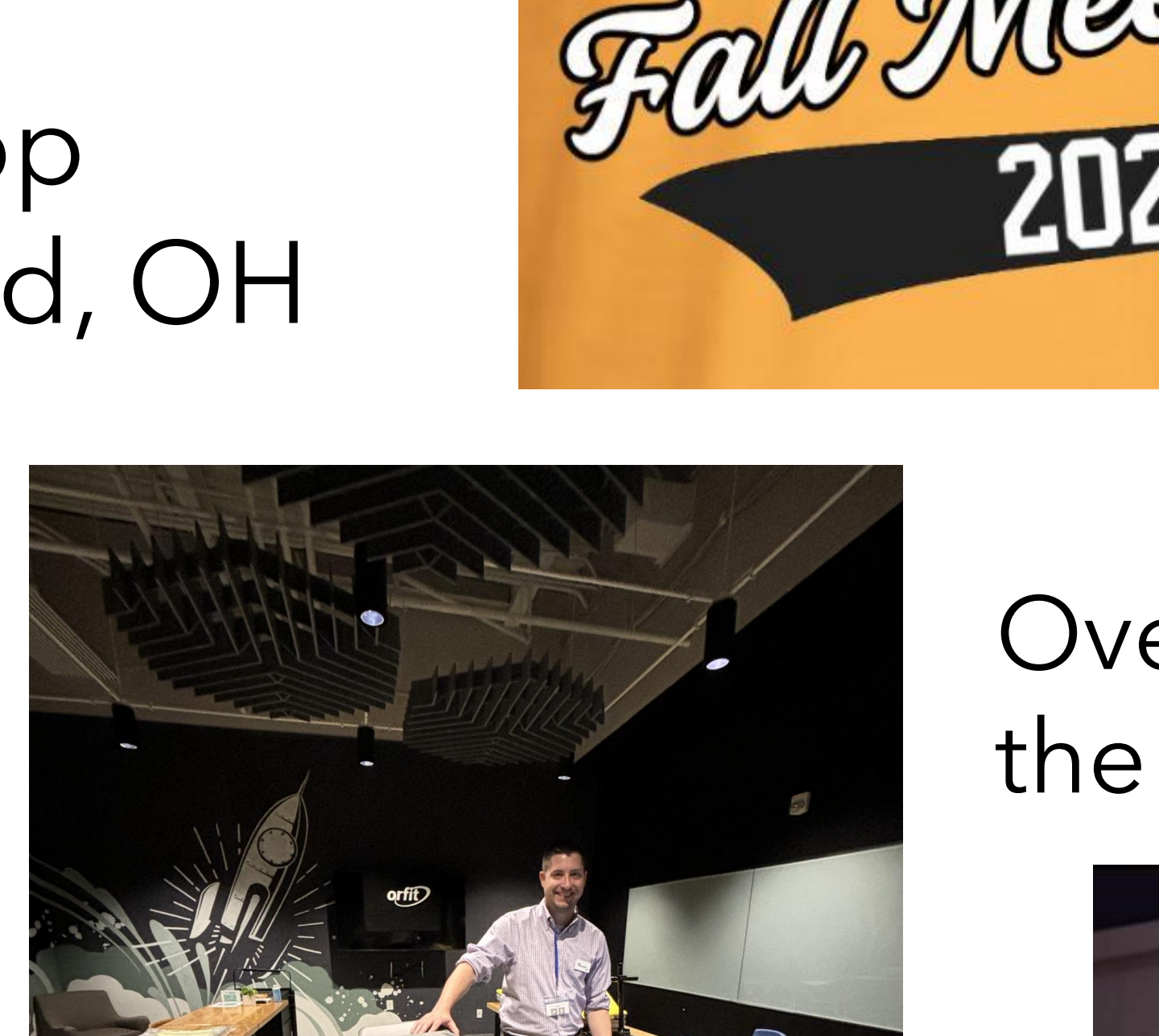
Over 10 POWV officers have been named Fellows of the AAPM, including these nominated by the chapter: