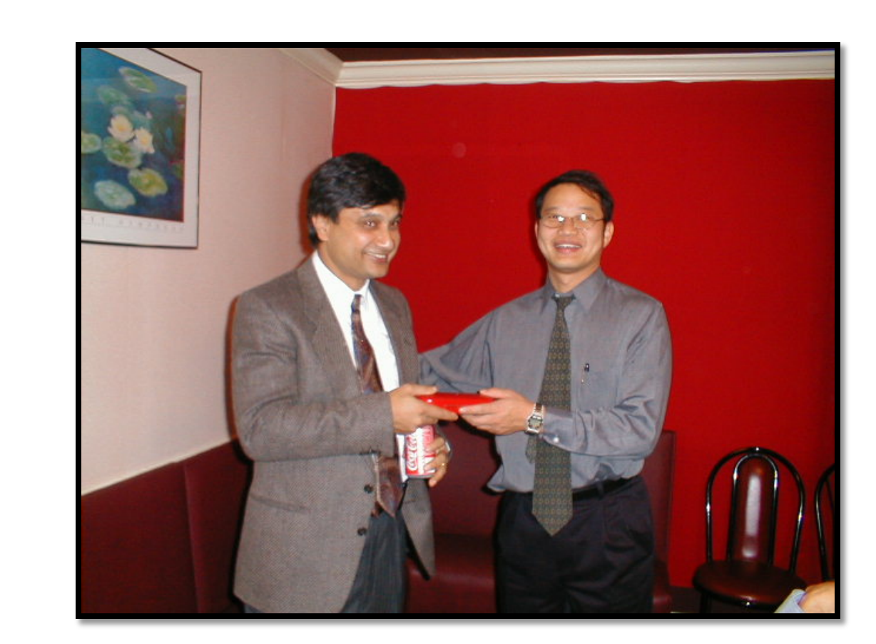
We invite renowned medical physicists to the meeting to present cutting-edge research in the medical physics field.