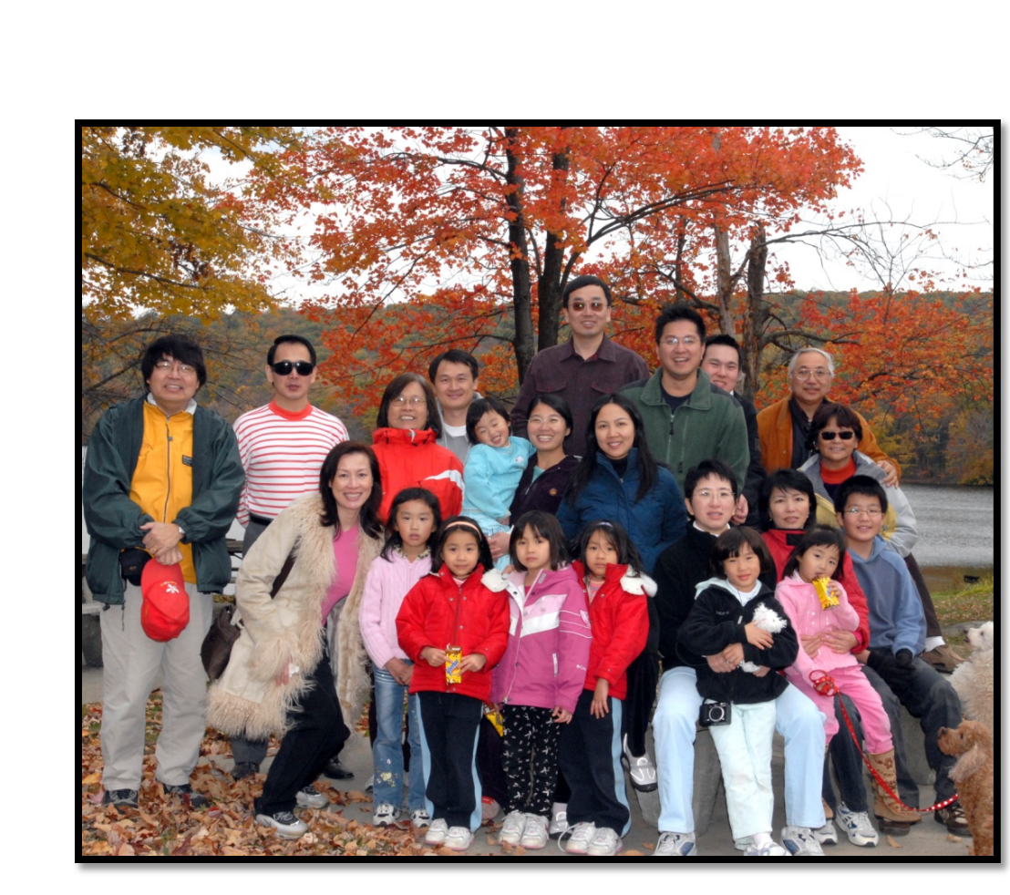
NJ physicists and families gathering. Can you identify 10 physicists from this picture? Any future physicists?