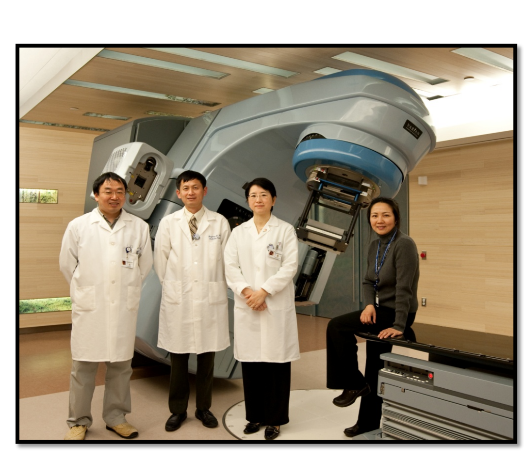
Physicists at Memorial SloanKettering Cancer Center, Basking Ridge, NJ.