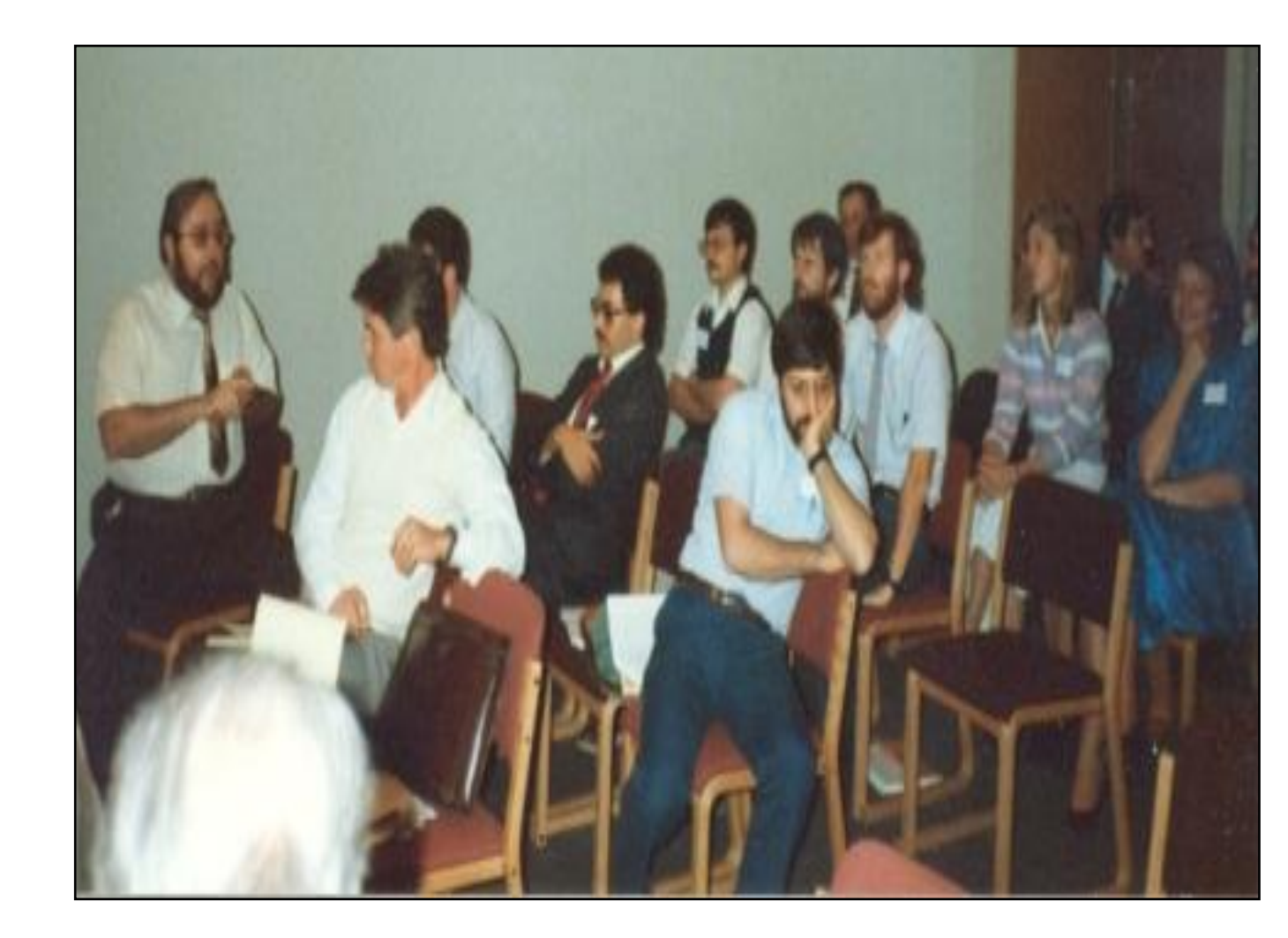
Pre-chapter days: 1985