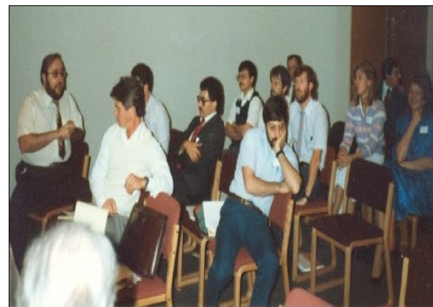
Pre-chapter days: 1985