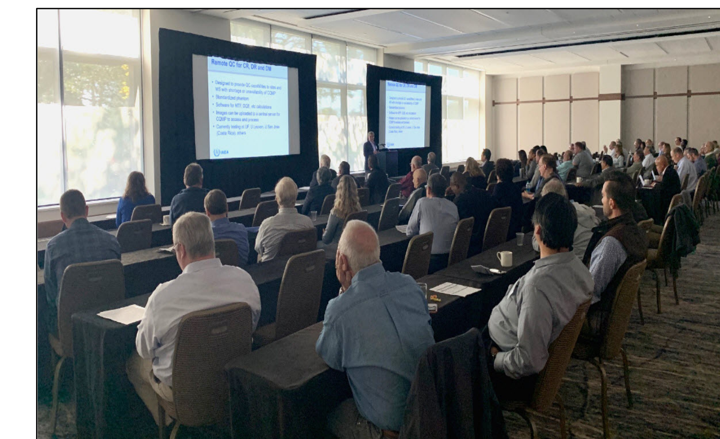
Spring 2020 Meeting

The rapid spread of COVID-19 in early 2020 caused a major health safety concern worldwide. After a short survey to the entire FL membership, the FLAAPM board decide to hold the first ever virtual meeting in Fall 2020. A total of 13 live presentations were offered in the 1-day meeting. The positive feedback from this meeting led to the creation of a successful 2-day virtual meeting in Spring 2021, with a record 24 live presentations and 162 attendees.