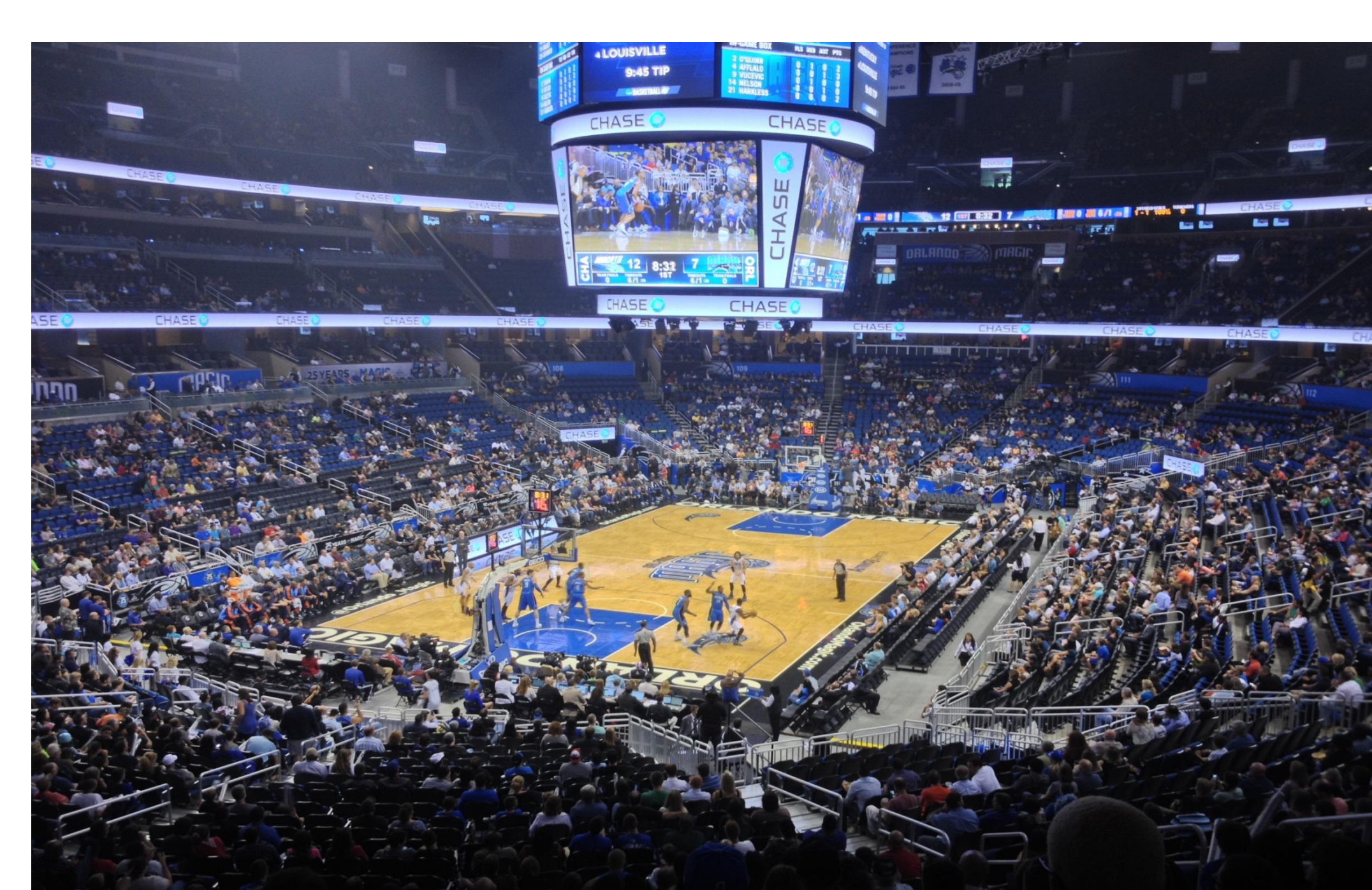
The night outs during the chapter meeting were the highlight of the social event, where members often connected professionally,