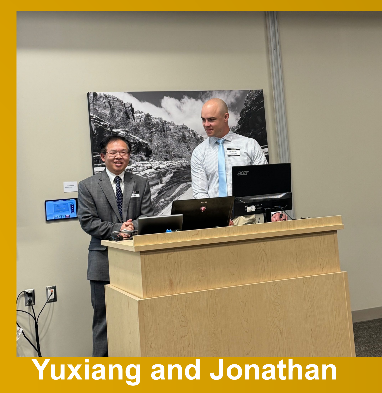
Kick off the meeting